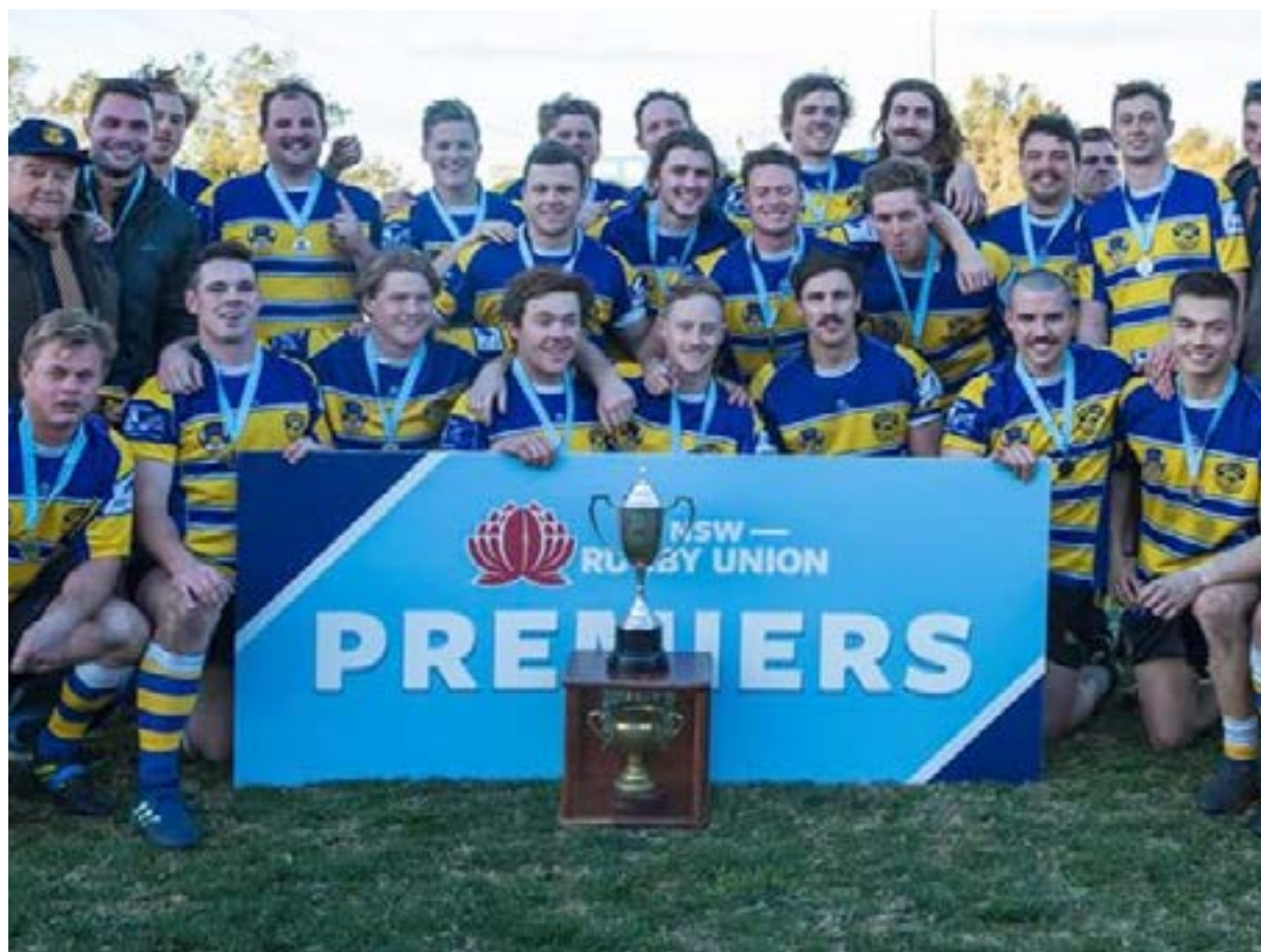
North Cronulla Sea-Lice start with a bang, celebrating their Meldrum Cup Premiership in their debut season.