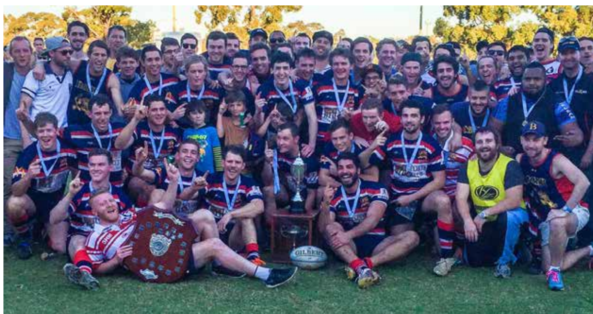
Another great year for Redfield Old Boys - Div Three Club Champions and Clark Cup Premiers.