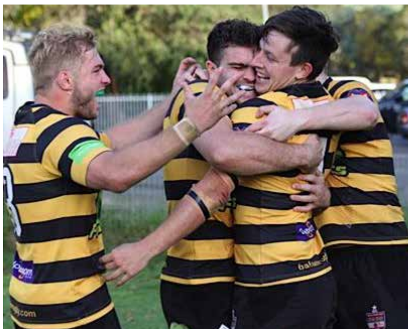
Balmain players celebrate their Kentwell Cup Premiership, after a thrilling comeback in the grand final against Knox.