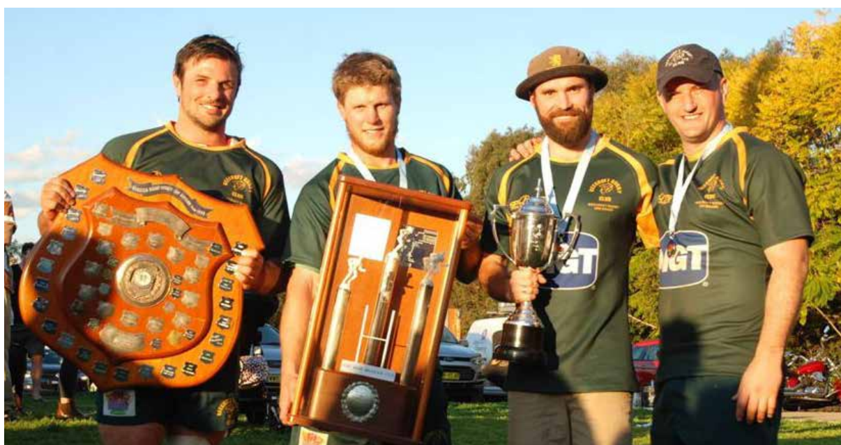
Beecroft players with (some) of their 2015 trophy haul.