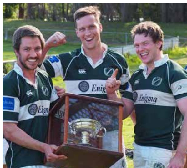
Forest Stockdale Cup players celebrate their premiership in an undefeated season.