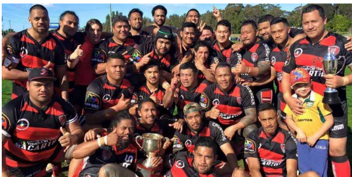
Macarthur Crusaders win the Halligan Cup in their debut season.