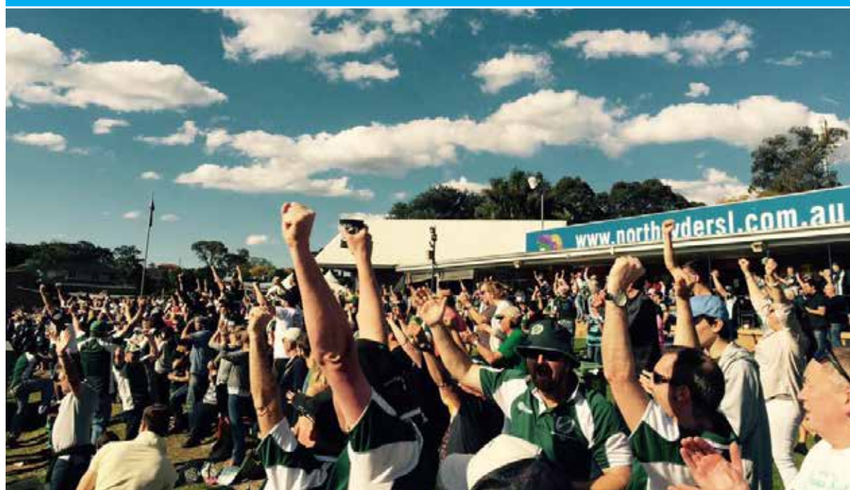
Forest RFC supporters turned out in huge numbers on a beautiful grand final day at T G Millner Field.