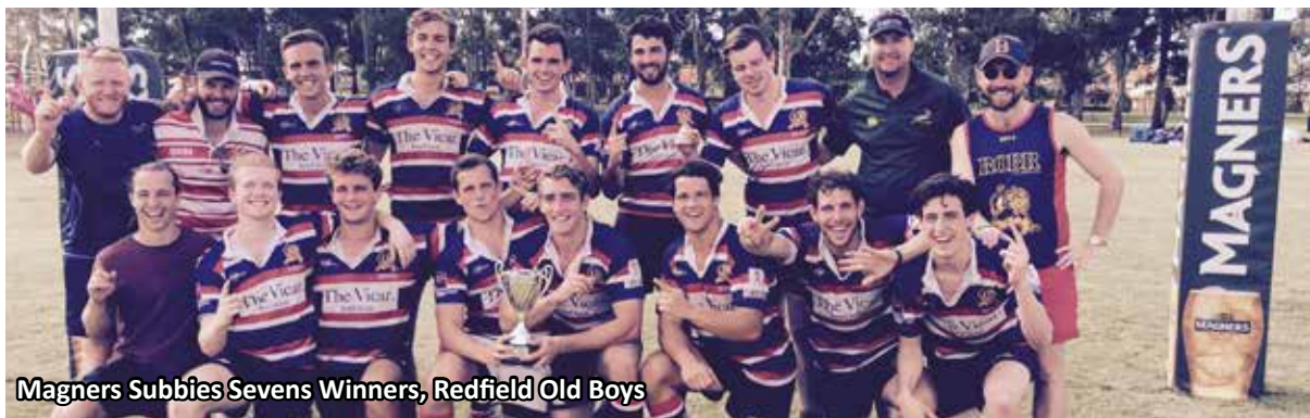
Magners Subbies Sevens Winners, Redfield Old Boys