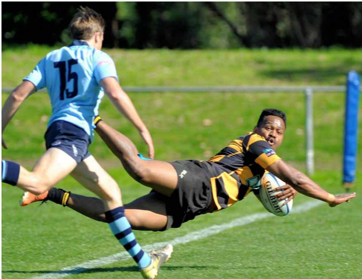
St Pats floating on air in their Judd Cup grand final victory over Colleagues.